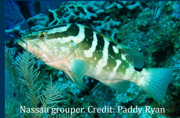
Nassau grouper.